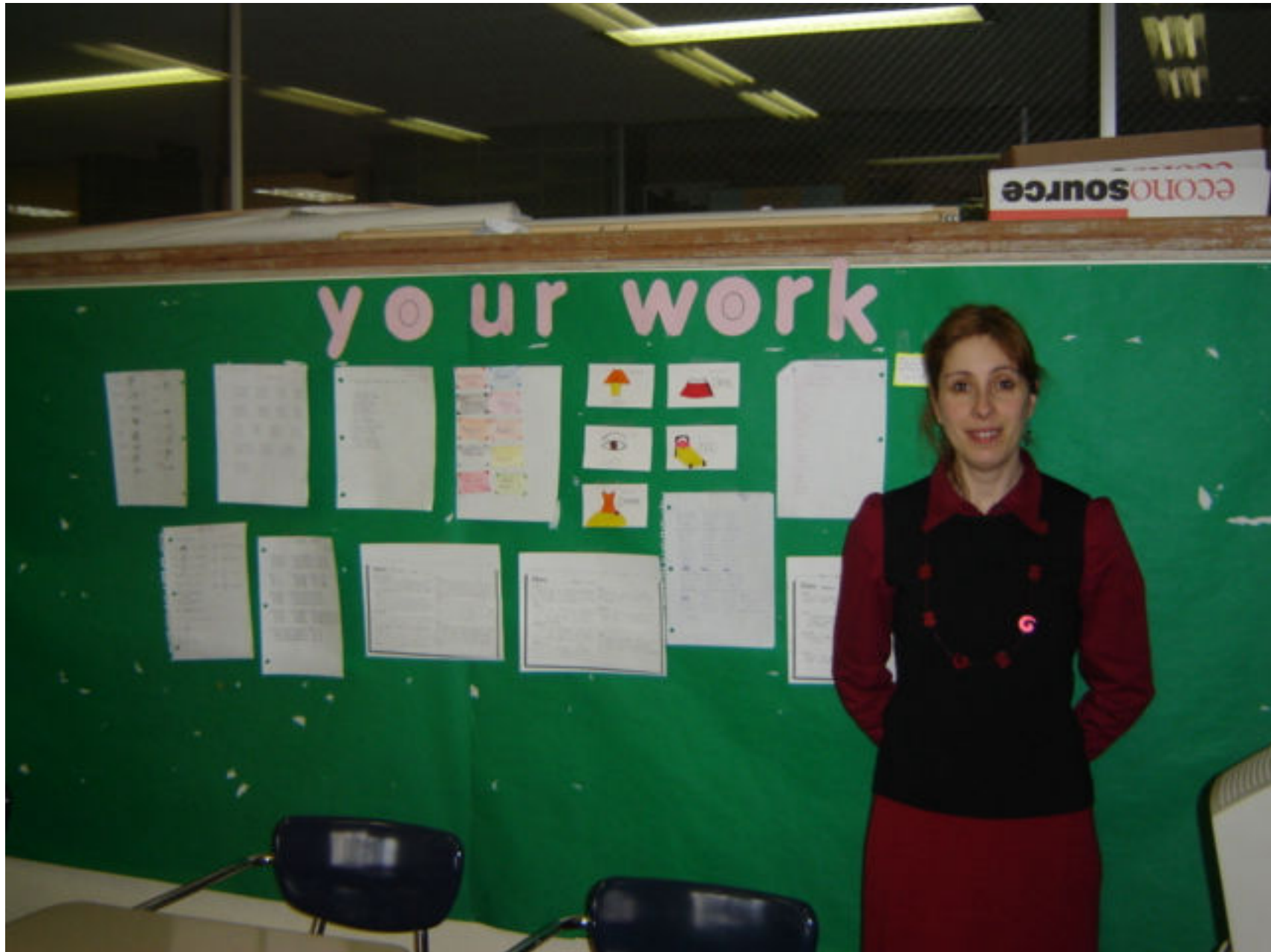
This is the board where my student's tasks are displayed. The ones here are for the weekly spelling contract to reinforce vocabulary.