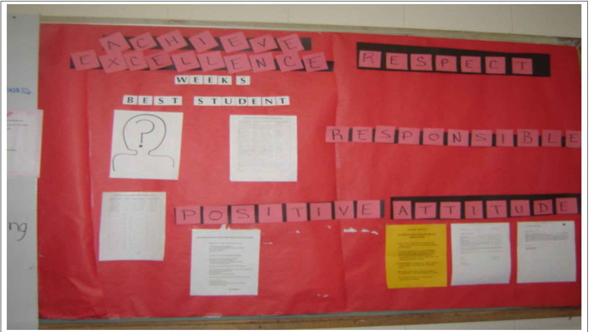
Board where the best students' awards, class rules and samples of letters sent to parents are displayed.